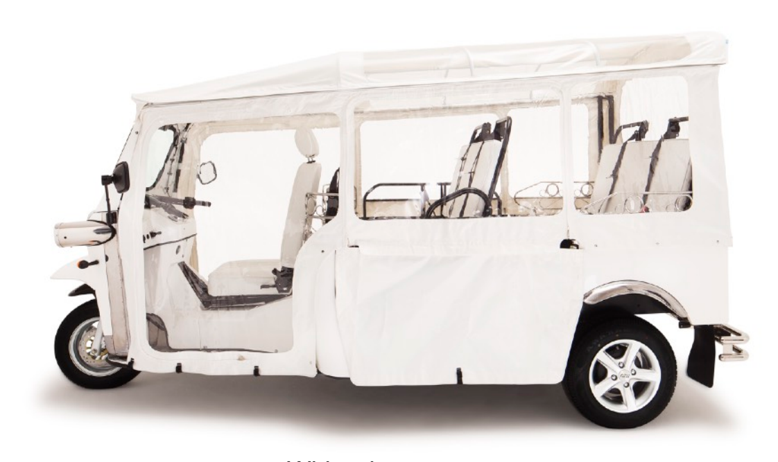
With rain covers